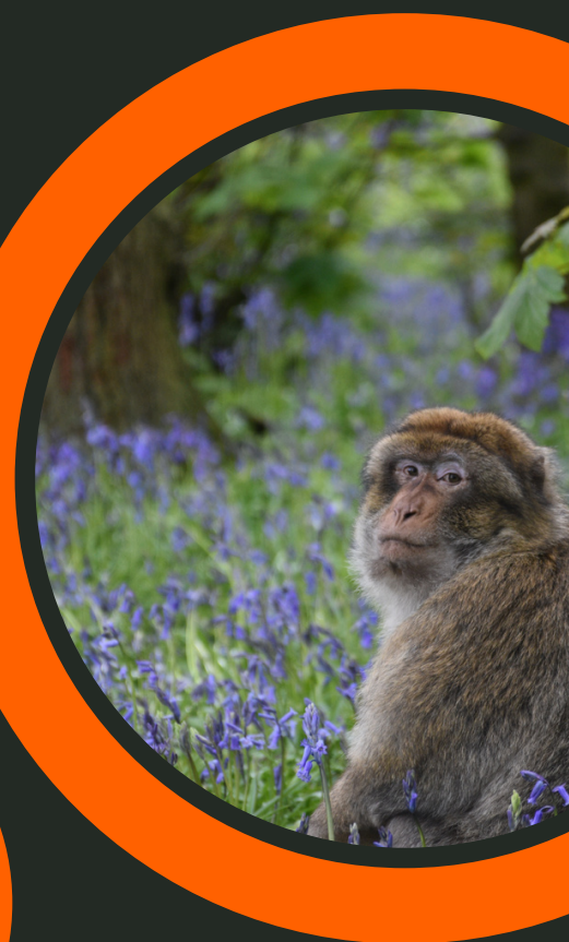
Page 01 www.monkey-forest.com